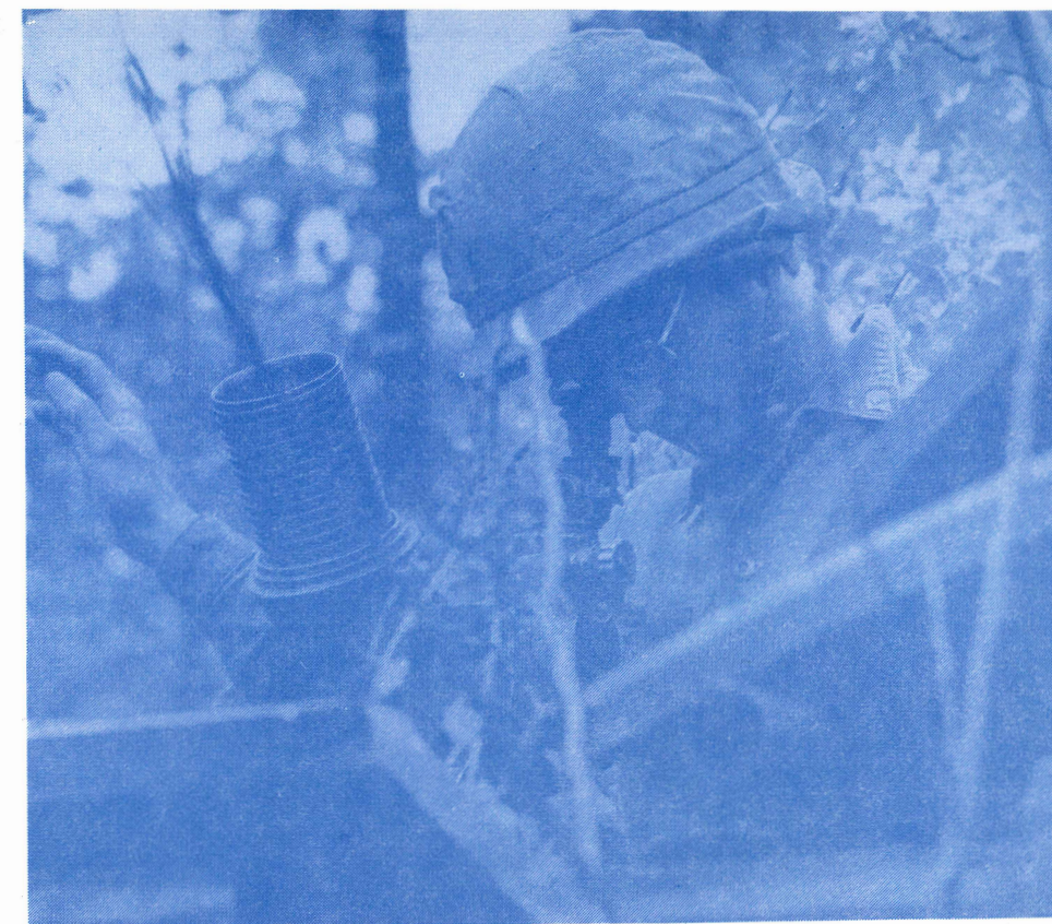
SIGHTING — SP4 Anthony Floyd, of Co. C, 1st Bn., 149th Infantry (Mech), located in Ravenna, sets up the bore sight for an 81 mm mortar during field operations in Fort Knox.